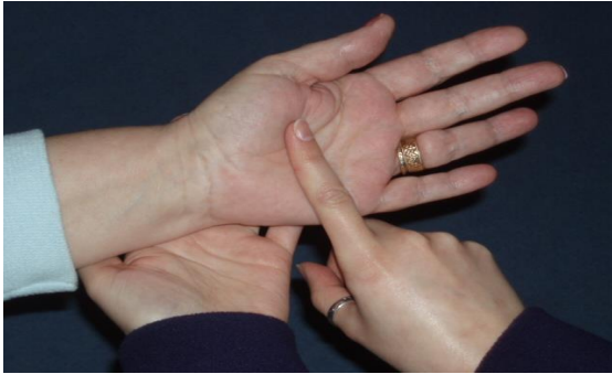
Deafblind Manual – letter 'L'