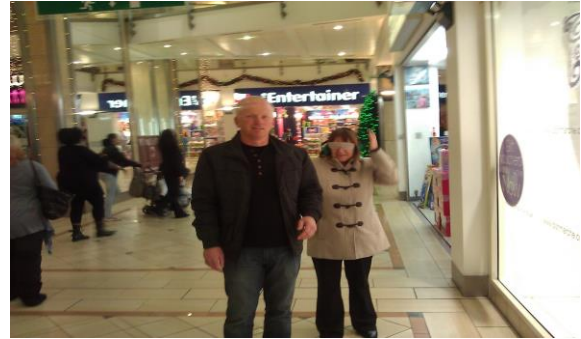
Environmental Information & Guiding

DBE values feedback and comments – please see: