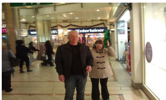
Environmental Information & Guiding

DBE values feedback and comments – please see: