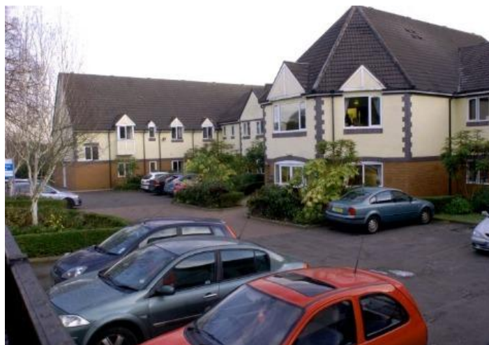
St George's Park Care Centre in Telford