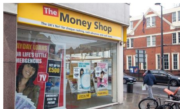
Financial crisis, job losses and lack of regulation has made UK a prime market for loan companies.

One large "payday loan" group told investors it aims to almost quadruple its UK presence – opening some 800 stores and expanding into deprived rural communities – to target families affected by redundancy or loss of income.