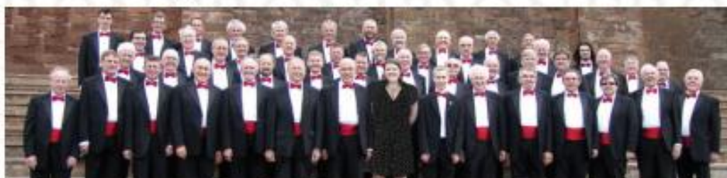
Fron Male Voice Choir