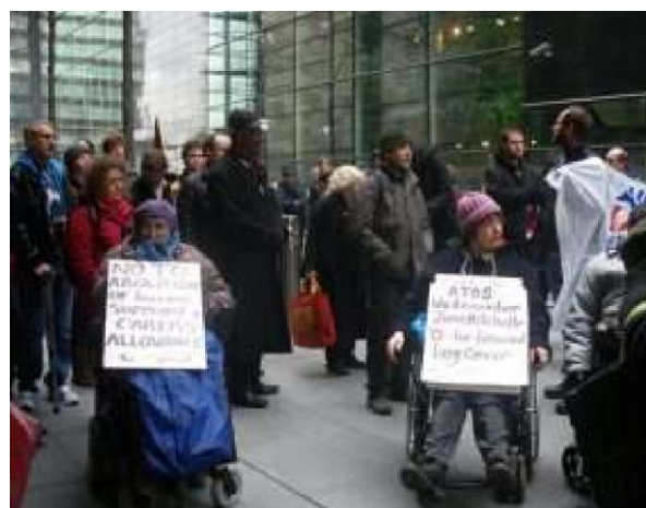
Protestors outside Atos building in London

See also http://www.bhfederation.org.uk/federation-news/item/1061-atos-protests-concerns-over-police and http://disabledpeopleprotest.wordpress.com/2011/01/24/atos-origin-and-triton-sqwe-were-kettled/