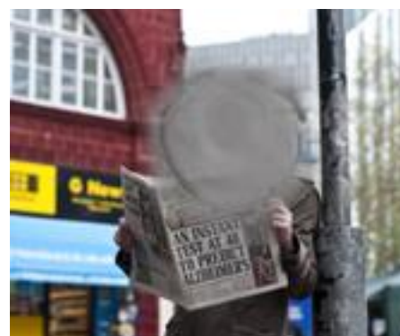
AMD gradually causes loss of central vision

The findings come from a study which looked at “geographic atrophy”, an advanced stage of the common condition known as dry AMD.