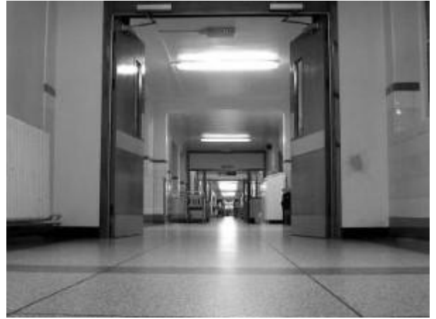
A bleak outlook for elderly patients in the NHS.

By Alex Stevenson, 15-02-2011, politics.co.uk , http://www.politics.co.uk/news/health/nhs-has-forgotten-we-re-humans--$21387240.htm