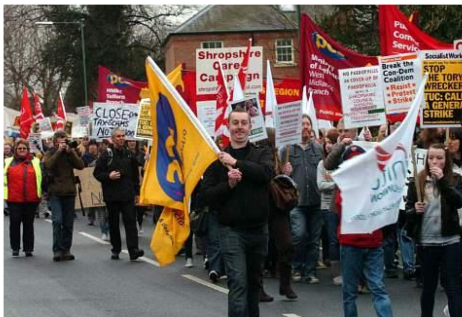
Anti-cutback protesters on the streets of Shrewsbury