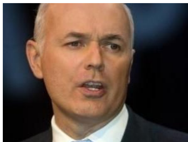
Iain Duncan Smith